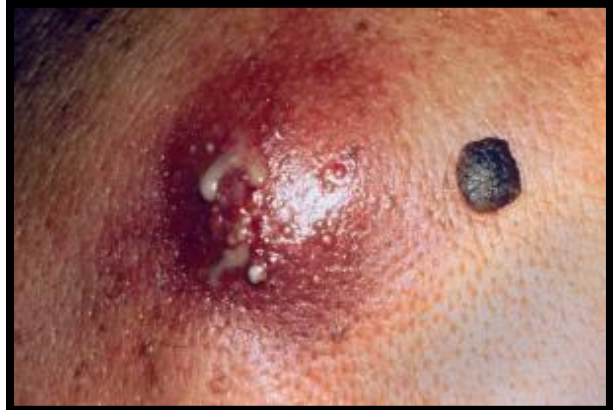
Sebaceous cyst, carbuncle, abscess